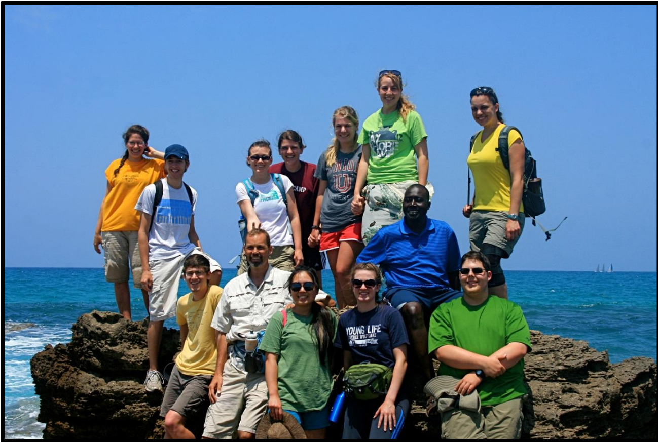
Kuyper College Students on the Israel Study Tour, May 2015